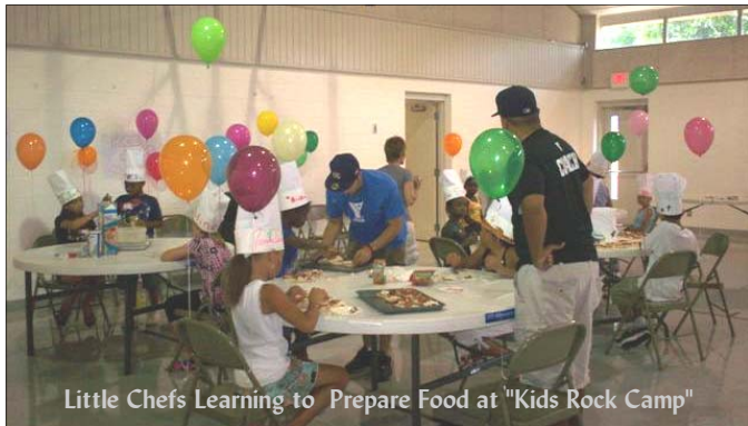
Little Chefs Learning to Prepare Food at "Kids Rock Camp"

Dont' worry if you missed the June Camp as we will be having another "KIDS ROCK CAMP" the last week of July 27-31st, 2009.