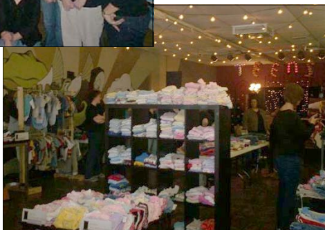
Right: Pictured are all the clothes that were set up for the families to come and receive FREE at the April 4th event.