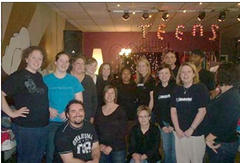
Left: Pictured are the volunteers at the April 4th Event.

The Convergence Collective and Bethel Foundation partnered together on Saturday, April 4, 2009 to Bless Families in the community by giving out Free Quality Clothing for Children along with a loaf of homemade bread from Big Sky Bread Company located at 6606 N. Western, the inside of Fusion Church was turned into a store for shopping. Thanks to Big Sky Bread partnering up with Bethel Foundation we were able to Bless 115 families.