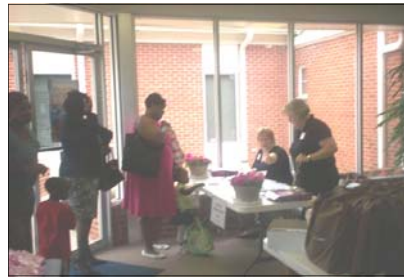
Moms line up to check-in for the April 25th Conference.