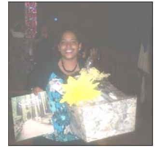
Above, one excited Mom shows off her fabulous door prize.